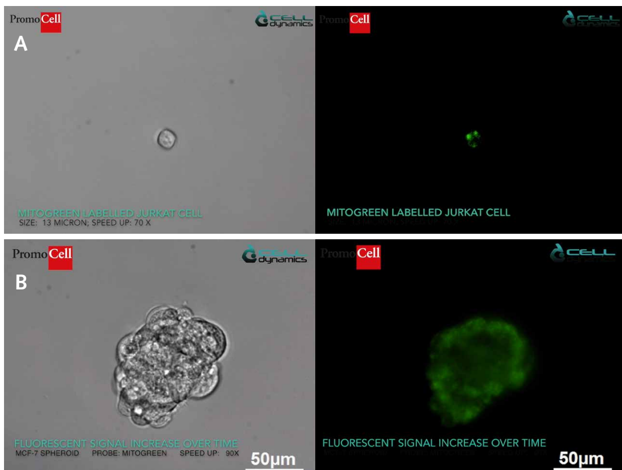
Fig. 1: Jurkat cell (A) and MCF-7 tumorsphere (B) cultured in 3D Tumorsphere Medium XF. Bright field image and green fluorescent microscopy (488 nm/ 523 nm). Cells were cultured in suspension and monitored in the CELLviewer (5% CO 2 ). Each experiment was conducted over 24 hours with a frame rate of 30 Hz and a field of view of 85 x 85 x 30 µm.

Staining of mitochondria with fluorescent dyes, antibodies or fluorescent molecules can greatly facilitate studies of their function and distribution and the viability of cells in healthy and diseased individuals.